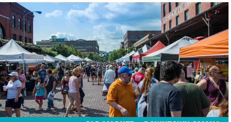
OLD MARKET — DOWNTOWN OMAHA