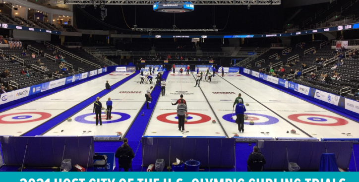
2021 HOST CITY OF THE U.S. OLYMPIC CURLING TRIALS