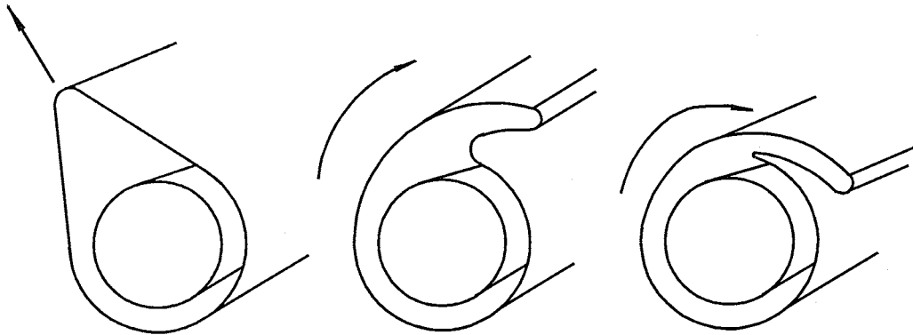
Fig 2 Slack Reduction Procedure for back over the top of the pipe, securing the fold at quarter points along the length of the pipe.

NOTE: Take up the slack in the tube to make a snug but not tight fit. Fold the excess