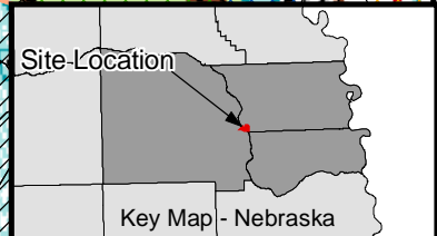
Figure 4-9 Topographic Map, Soil Survey, and NWI Map of the Douglas County Well Field Mitigation Site Metropolitan Utilities District

Source: USGS 7.5-Minute Quad for Wann, NE; USFWS NWI Data, & USDA NRCS Soil Survey Geographic (SSURGO) Data